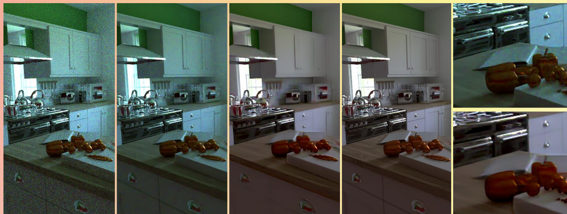
Figure 1: Visual comparison of different denoisers on Kitchen scene. From left to right: Noisy, OptiX, ours ( \lambda +PCA+DS), Ground truth, and crops: OptiX (top), ours (bottom).