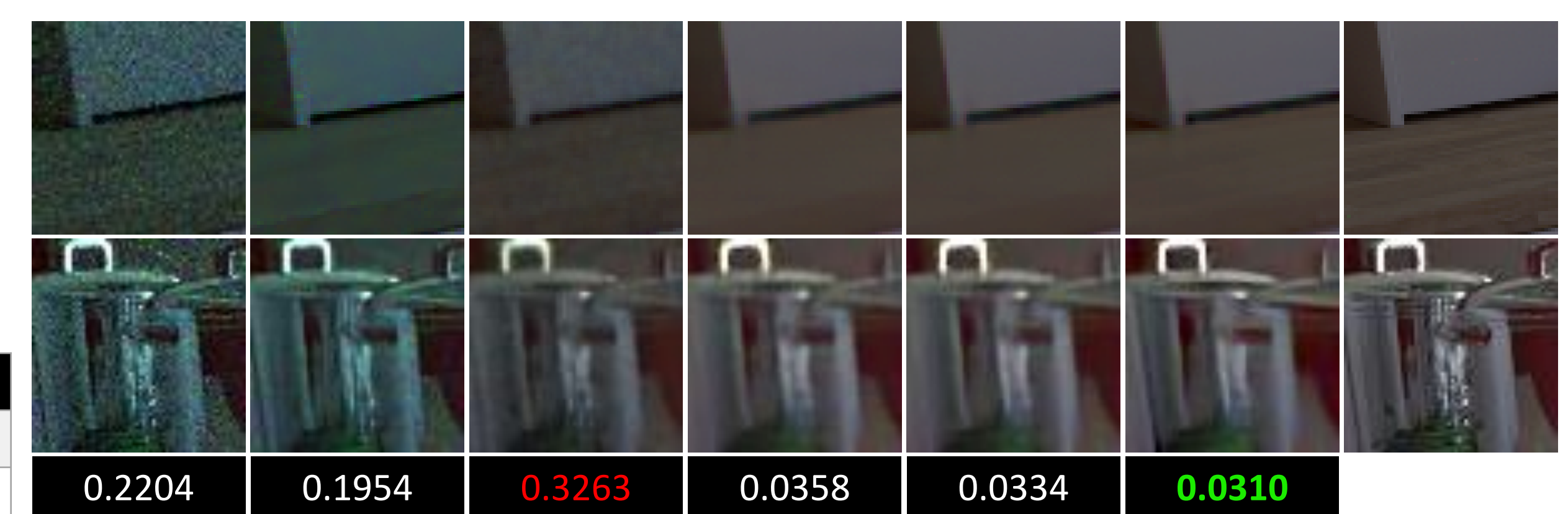
Figure 3: Crops taken from three scenes denoised with various methods. From top to bottom: Bathroom, Bedroom and Kitchen. From left to right: noisy, OptiX, RGB domain (RGB), Spectral domain: LSF without PCA ( \lambda ), with PCA ( \lambda +PCA), and with DS ( \lambda +PCA+DS). NRMSE was used as the evaluation metric.